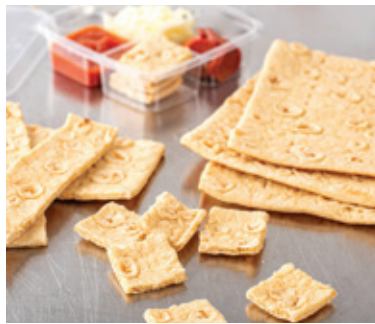
WHOLE GRAIN STACKABLES FLATBREAD