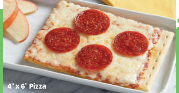
4" x 6" Pizza

With more choices and creative options, Conagra Foodservice and Waypoint's dedicated K-12 teams are here to help with flexible meal items for these difficult times. Whether you're in need of pre-portioned, individually frozen, packaged products or looking for microwave instructions we've got you covered. The K-12 dedicated teams at Conagra Foodservice and Waypoint are here to support you with commodity needs, bids, product information and so much more. We're here, ready to serve you!