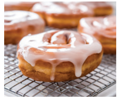
WHOLE GRAIN CINNAMON RING