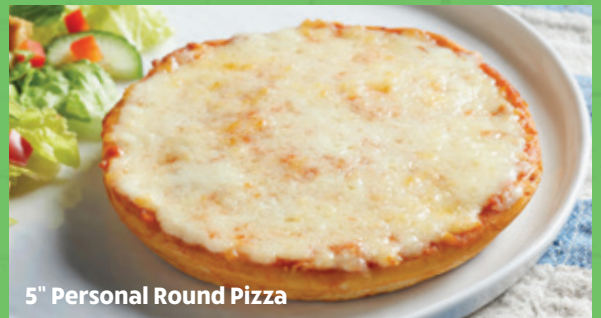
5" Personal Round Pizza