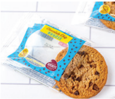
WHOLE GRAIN CHOCOLATE CHIP COOKIE