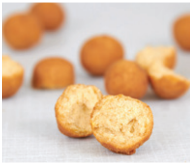
WHOLE GRAIN CORNBREAD POPPERS