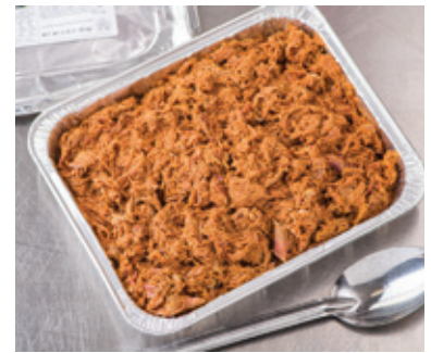
SAUCED COMMODITY PULLED PORK