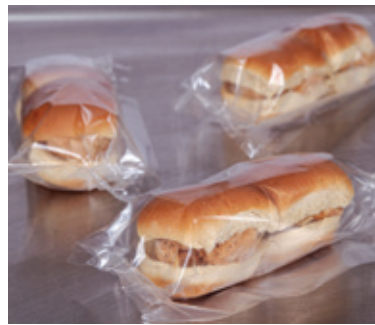
PORK BBQ SLIDER WITH TRADITIONAL SAUCE ON A WHOLE GRAIN BUN